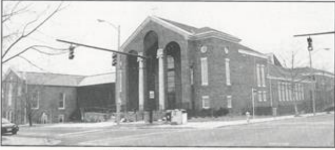
The Renovated Church—1994

Church is listed on THE NATIONAL REGISTRY OF HISTORICAL SITES , by US Department of the Interior