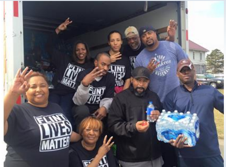
ASBC DONATES $50,000 of water to Flint, MI and provides teams for water delivery. (On-going)