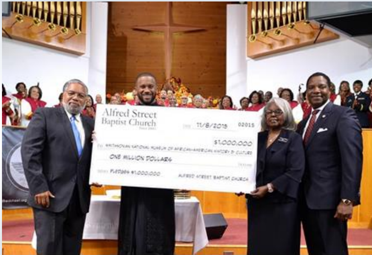
ASBC DONATES $1,000,000 to SMITHSONIAN MUSEUM