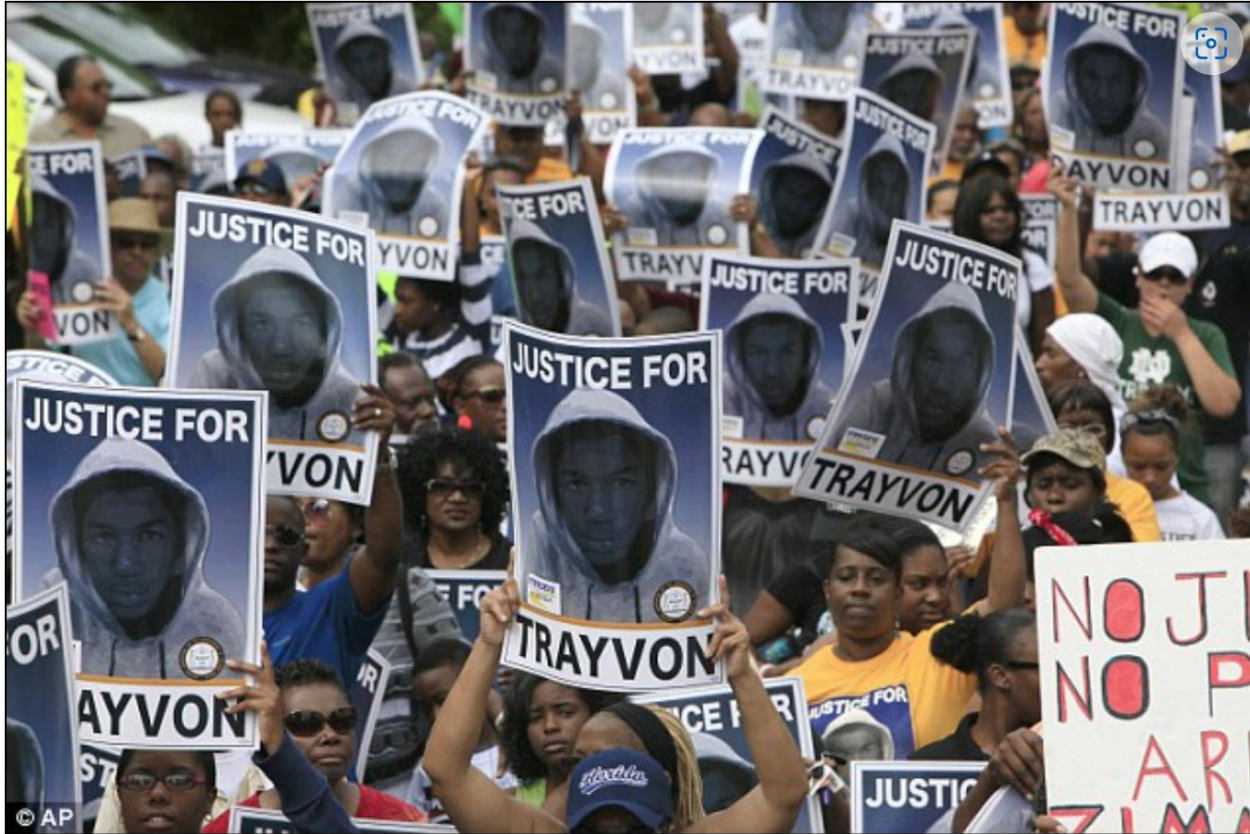
Protesters in Sanford carry signs of the dead teenager and chanted Justice for Trayvon as they walked to the police station to demand that Zimmerman is arrested